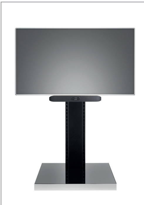
Installation example at Info-Tower Single L (Item no.: 1566)